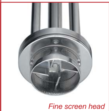
Fine screen head